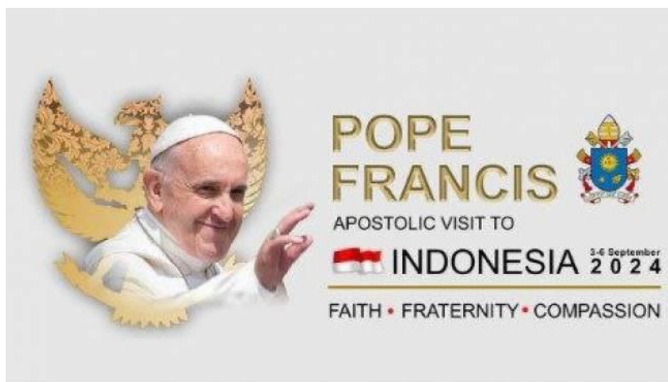
Picture 1 Official Logo of Papal Visit

Pope Francis wrote the document Fratelli Tutti which focuses on the importance of continuous effort to reach peace based on Catholic teaching. In his apostolic journey to Indonesia in 3-6 September 2024, he brought the theme faith, fraternity, compassion. Pope, in his speech during the meeting in Cathedral of Our Lady of the Assumption Jakarta, mentioned that those three things are the virtues of Indonesian Catholic people. As an Indonesian citizen, Catholics live among the cultural diversity. Catholic always brings a unite and peaceful unity. Thus, as Indonesian Catholic, Pope said, we should always thrive for bringing peace; this peaceful community is reflected in Pancasila (Francis, Content Francesco en Speeches, 2024).